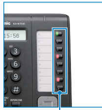
Flexible CO Buttons

Flexible CO buttons for one-touch function access save time and effort. These keys can be used to store telephone numbers, or access frequently used phone system features.